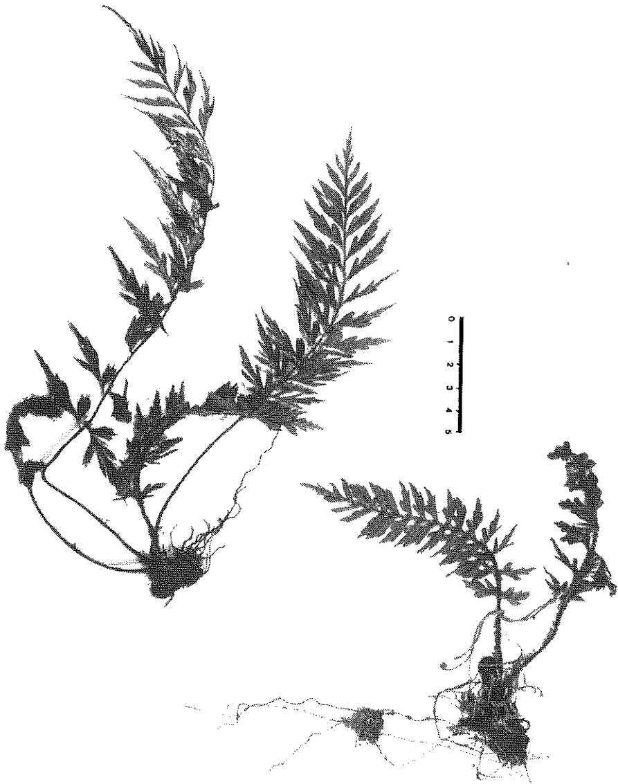
Fig. 1 - Asplenium aethiopicum subsp. braithwittii . Holotypus - MAD: Lombo de Cima, estrada Ribeiro Frio-Faial, ORMONDE 2878 (COI).