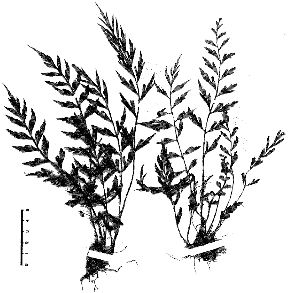
Fig. 2 - Asplenium aethiopicum subsp. braithwaitii . Paratypus - PAL: Los Tilos, PITARD 1210 (P).