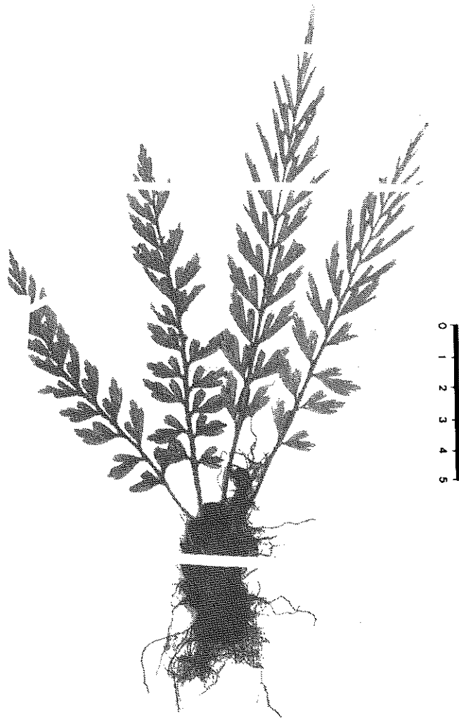
Fig. 4 - Asplenium filare subsp. canariense . Herbarium specimen - PAL: Bco del Rio, BOLLE (B-020076).