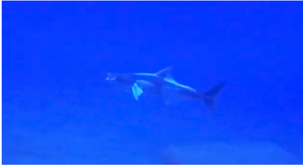
Fig. 2 – Cobia Rachycentron canadum ca. 12 m of depth at the South coast of Madeira, between Paúl do Mar and Jardim do Mar.