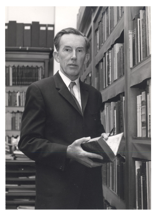
Fig. 1 – Lipke Bijdeley Holthuis in 1973.

cooperation was the impressive study of West African Brachyuran Crabs (Manning & Holthuis, 1981), followed by the revision of deep-sea red crab family Geryonidae (Manning & Holthuis, 1989), among other crab families.