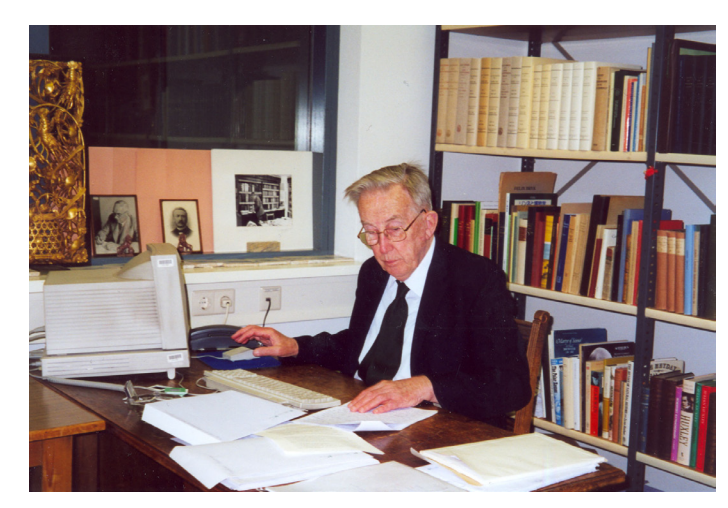
Fig. 4 - Lipke Bijdeley Holthuis in 2007.

I am convinced that the teachings and encouragement of my three mentors were instrumental in my career as a marine taxonomist, part-time between carcinology and ichthyology due to many research projects in the Canary Islands region and Macaronesia sensu lato (Cape Verde Islands and southern Morocco and Western Sahara included) in which I have participated. My great fortune and opportunity was that my three mentors came my way, encouraging me to feel passion for taxonomy, nomenclature and the etymology of marine fishes and crustaceans.