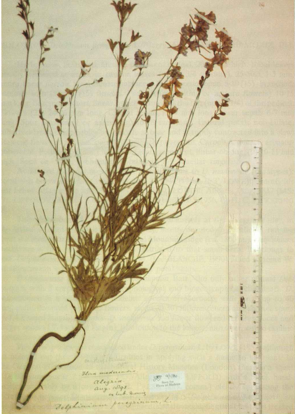
Fig. 2 -- Holotype of Delphinium maderense C. Blanché (BM).