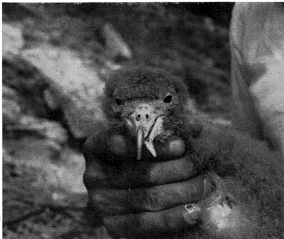
Fig. 2—Front view of the third case of malformations as mentioned above.

The second case (ring number L29510, weight 775 g., bill length 30.75 mm., mandible length, measured from the proximal end of the nasal tube, to the cranium, 45.65 mm.) showed a 6^\circ deviation of the mandible to the right and also a reduction in size of the maxilla. Almost all the maxillary unguis was missing (see Fig. 1b). The nest was on the "Enseada das Pedreiras".