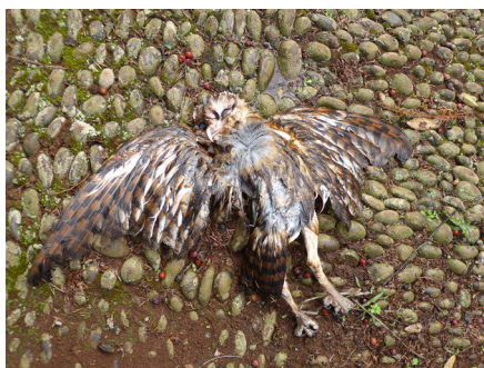
Fig. 3 – Tawny Owl Strix aluco at Palheiro Gardens, Funchal, Madeira, November 4th, 2013.

The observer's opinion is that it drowned after hitting the strings over the water surface of the pond, used to deter birds catching the ornamental fish. Unfortunately, the specimen was discarded before the authors could collect it. Frequency status: Only one record.