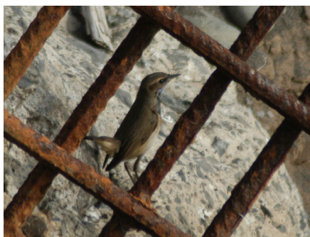
Fig. 4 – Bluethroat Luscinia svecica on an iron structure at Ribeira Brava beach, Madeira, March 17th, 2012.

A single bird was observed and photographed by Reg Tookey on the 17th of March 2012 at Ribeira Brava beach (CORREIA-FAGUNDES & ROMANO, 2012b). This was the first record of this species from Madeira. Frequency status: Only one record.