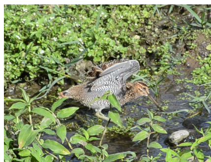
Fig. 2 – Wilson's Snipe Gallinago delicata at the mouth of Ribeira de Machico, Madeira, October 19th, 2013.