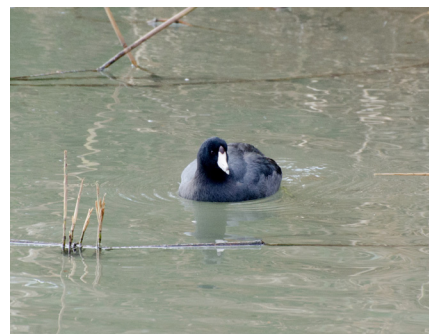
Fig. 1 – American Coot Fulica americana at Lugar de Baixo pond, Madeira, January 20th, 2012.

A bird was seen feeding and preening at Machico river mouth both on the 19th and on the 21st of October 2013. This specimen was photographed and videoed by two of the authors (CORREIA-FAGUNDES & ROMANO, 2013b). Frequency status: Only one record, as the authors believe it was the same bird observed twice in the same spot.