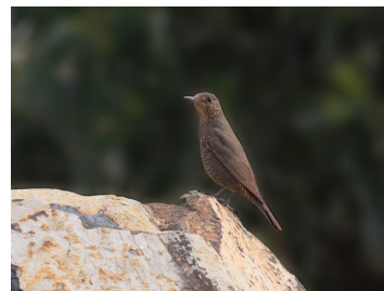
Fig. 5 – Blue Rock Thrush Monticola solitarius at Ponta do Pargo, Madeira, March 10th, 2012.

2012b). The previous record from 1838 (POESCH, 1961) was considered as possible vagrant by BANNERMAN & BANNERMAN (1961) and subsequently as dubious record by ZINO et al. (1995) and ROMANO et al. , (2010). It is now confirmed, 174 years after! Frequency status: Exceptional.